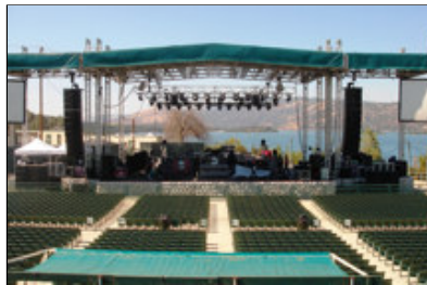
A typical EV rig set up on the recent Bad Boys of Rock tour.

New York (October 23, 2007)-- Hinder, Papa Roach and Buckcherry spent the summer on the road on their "Bad Boys of Rock" tour--a venture that wrapped up its summer run on September 22, having delivered the goods in venues across America. Along for the ride was an Electro-Voice PA deployed by LD Systems of Houston, TX, which goes back into action later this week with the bands as the tour picks up again for a fall leg in Corpus Christi on Saturday, October 27.